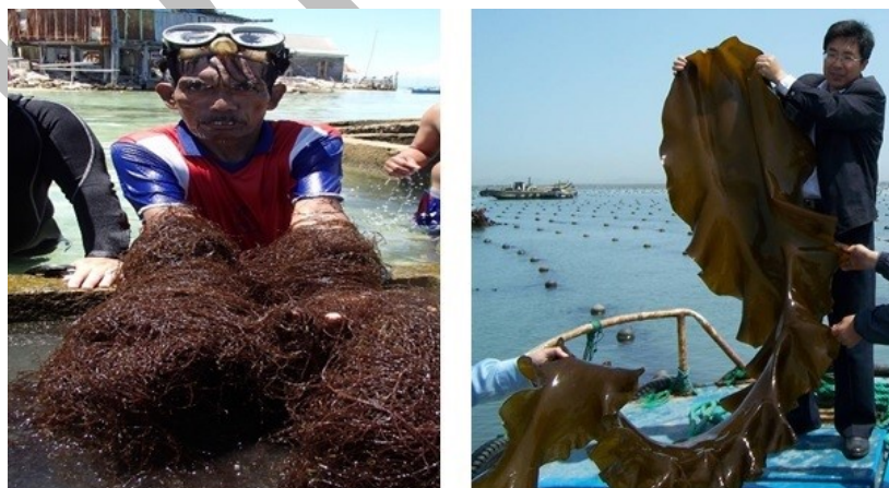
Examples of commonly cultured types of seaweed: red (left), and brown (right).

Dry seaweed is about 50% carbohydrate dry mass, ideal for biofuel production. The energy in seaweed can be captured by microbial anaerobic digestion to produce methane or microbial breakdown into sugars followed by fermentation for ethanol production, or hydrothermal processes to produce bio-oil and biogas. Annual global seaweed production needs to exceed about a billion dry tons before people will want to switch its primary use from food to energy. In the meantime, processes refined at Haven Atolls can extract significant energy and recover fertilizers from seaweed processing discards and the wastes of people and animals eating seaweed.